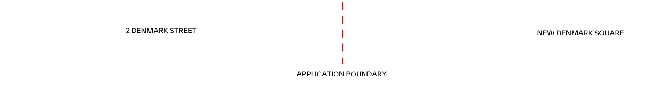
2 BLOCK A - PROPOSED SOUTH ELEVATION (01) 1:100